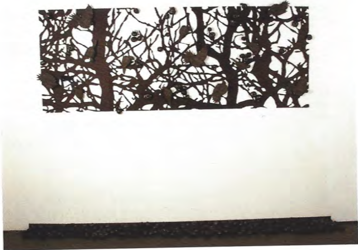
Mia Mulvey Arinae , 2010 Porcelain, Paper, Apples 3 x 8 x .5 Feet